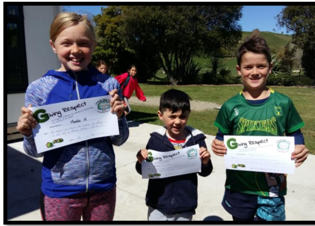
Best Bus Award