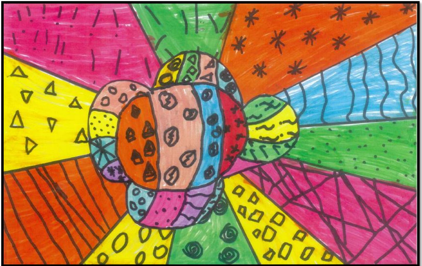
Art by Remi